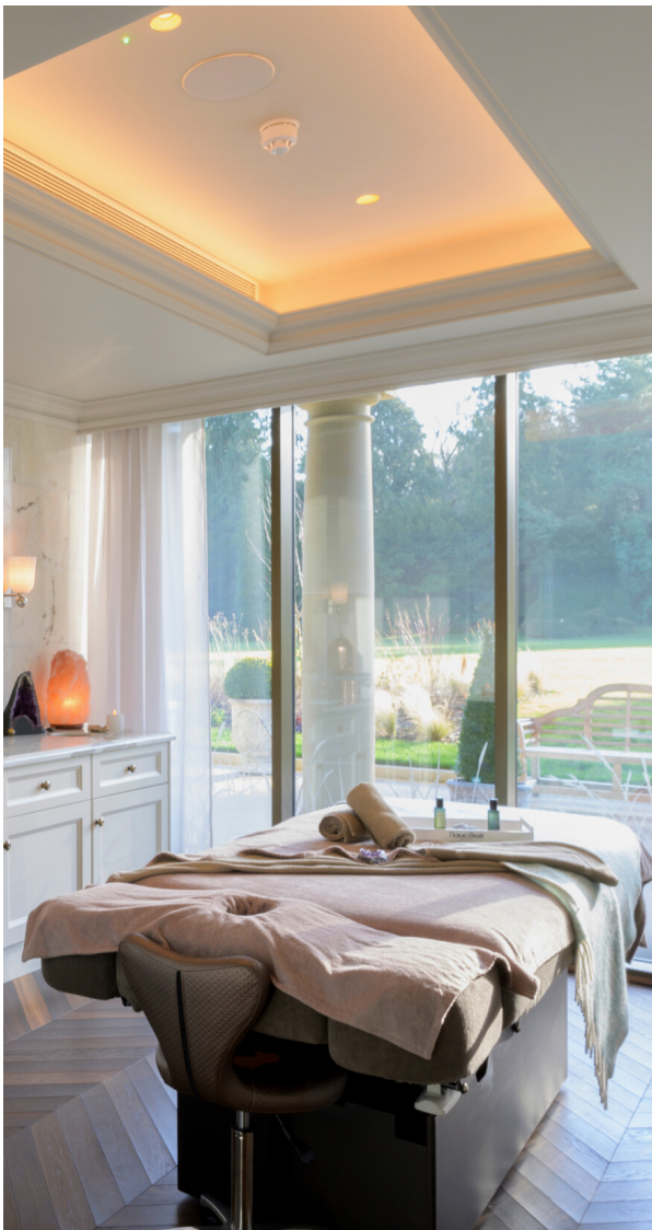
Three Graces Spa Treatment Room

To automate and control all technologies within the venue, Clever Association designed a Crestron control system that allows the various entertainment and lighting solutions to be automated or manually adjusted throughout the day. It is important that the entire venue looks and performs at its best at all times and this can be achieved with little to no input from the team. When hosting a specific event, automated lighting scenes and music selection can be overridden, to perfectly match the occasion.