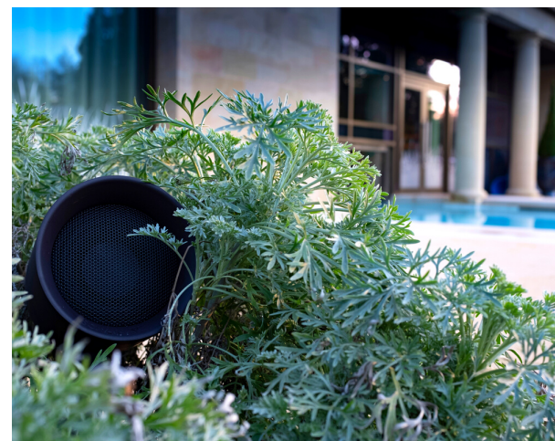
Sonance Landscape Series, Outdoor Speaker