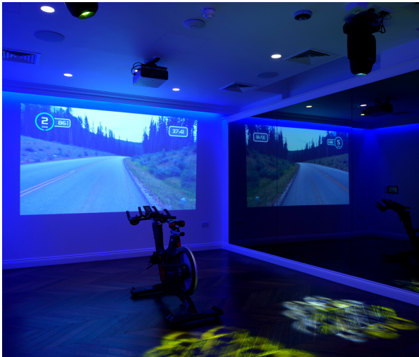
Elite Gym Spin Studio Projection

A ceiling mounted Canon video projector can be found in the mains studio, typically used for Spin bike sessions. This was connected up to a dedicated PC so that the instructor led sessions could be enhanced via performance statistics and visuals projected onto the wall.