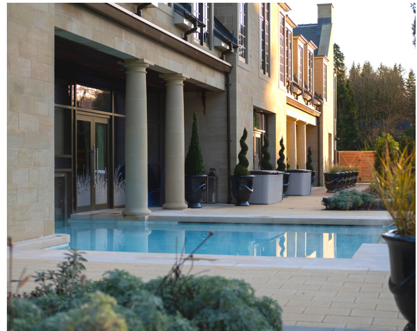
Three Graces Spa Outdoor Pool