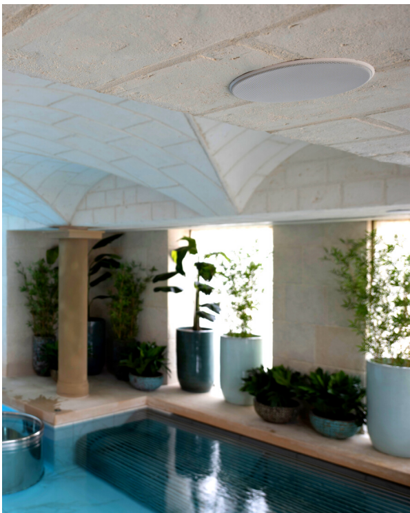
Three Graces Spa, Bowers and Wilkins Ceiling Speaker