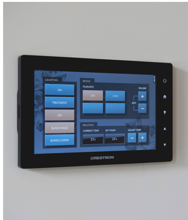
Three Graces Spa, Crestron Touch Screen